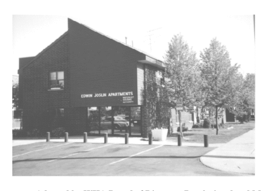
Adopted by WHA Board of Directors Resolution dated March 30, 2015