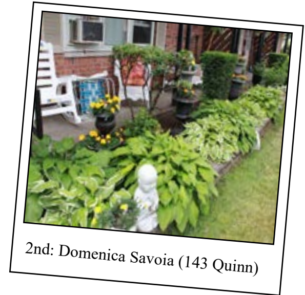
2nd: Domenica Savoia (143 Quinn)