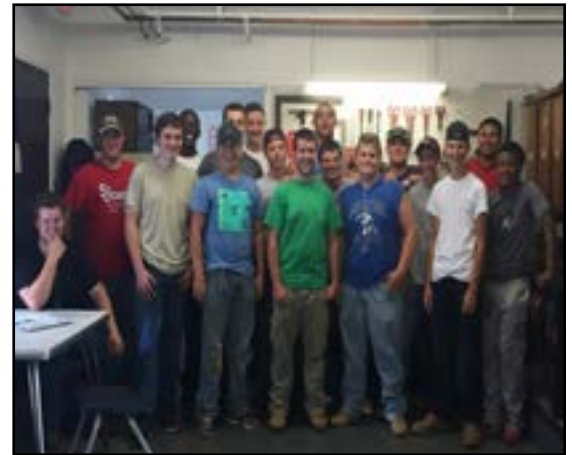
Thank you to our summer help!

We need access to ALL of your windows. Please make sure ALL items are removed from the window area. Please remove ALL items off the top of your stove. Call in any work orders before the inspection.